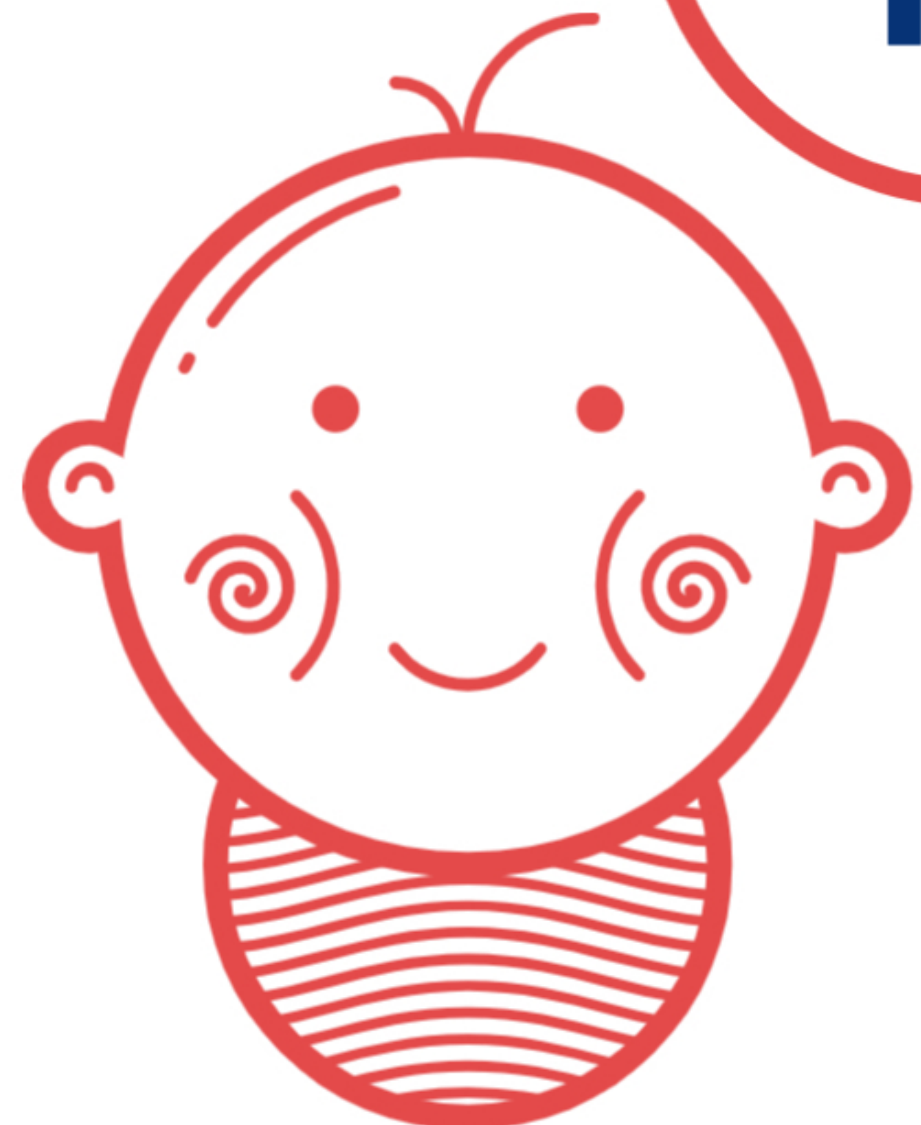
By 2 years old