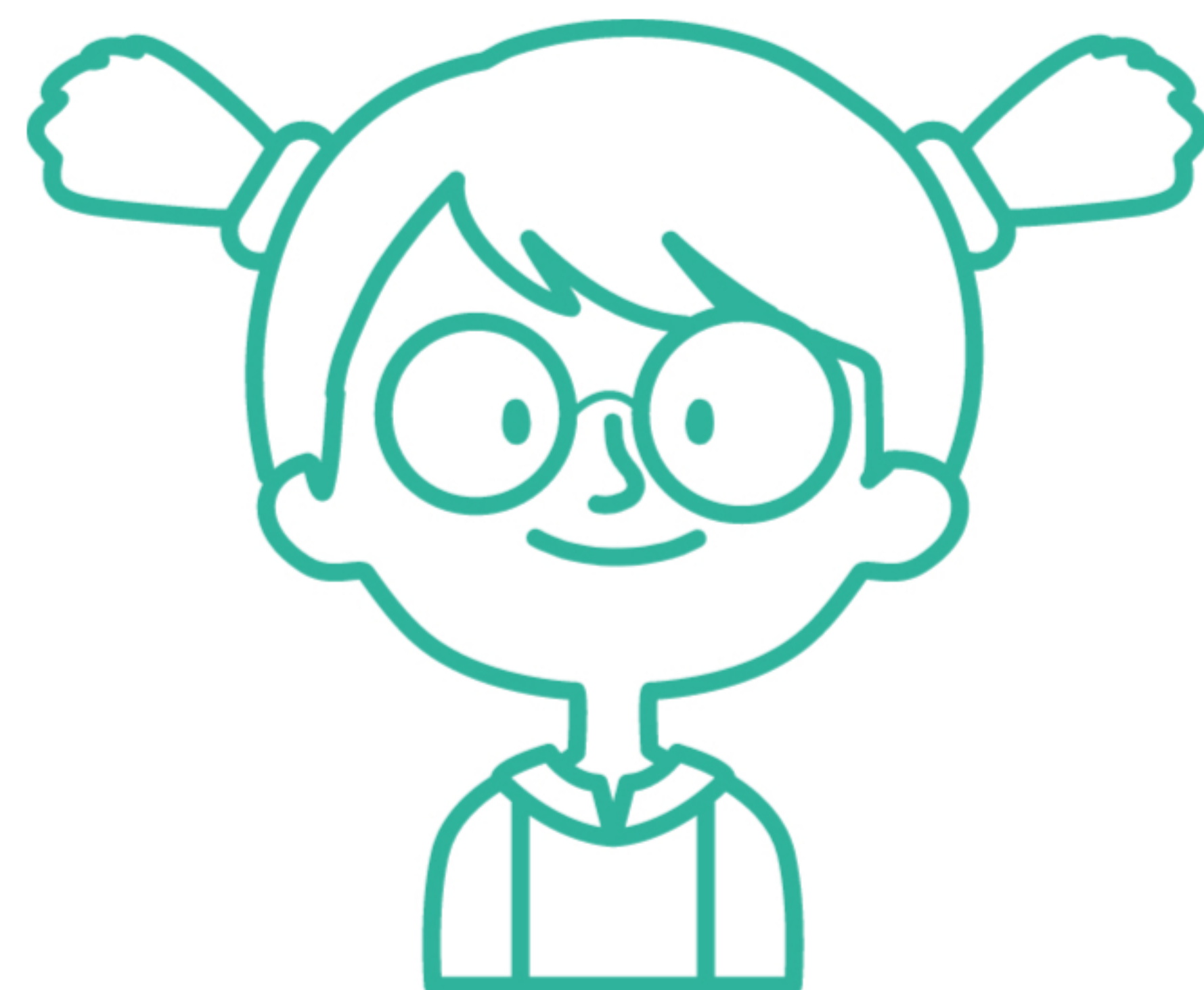
By 3 years old